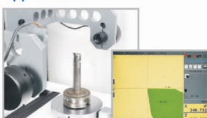
Checking of a fine boring tool