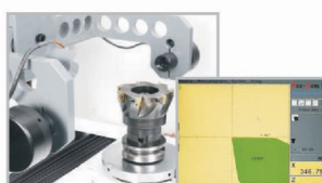
Checking of a corner cutter