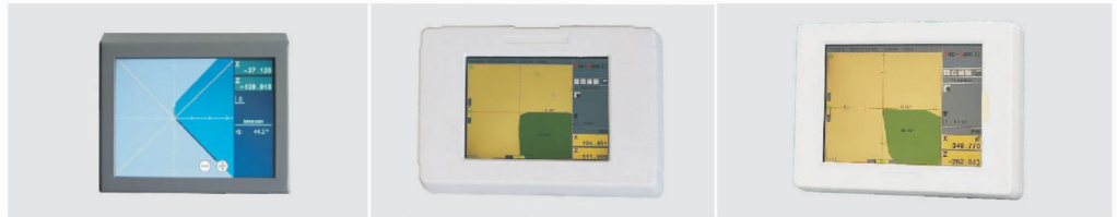
Image Processing system available in three different types Microscan-I, Microscan-II & Microscan-III